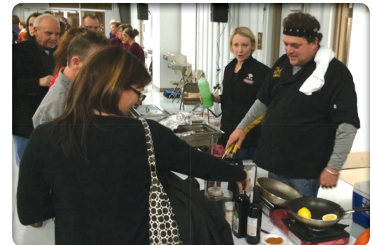
Skaliwags - Algoma

It was a true celebration of the diverse culinary and beverage offerings in Kewaunee County. The Kewaunee County Economic Development extends congratulations to the winners and to all the talented local business who participated. Thanks to the sponsors who made the event possible.