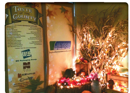
Thank You to all who volunteered!