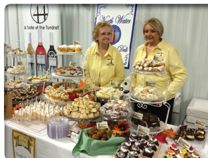
North Water Street Bakery & Deli - Algoma