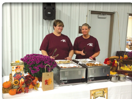
Burdick's Bar & Grill, Luxemburg