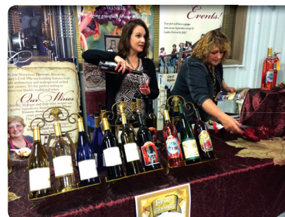
von Stiehl Winery - Algoma